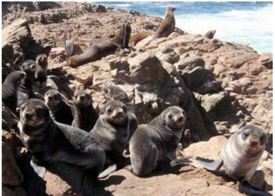
Northern fur seals breed only on West End Island, within the Farallon Wilderness.

Ryan Berger, Farallon program biologist for Point Blue says northern fur seals are unlike other seal species. “They are more like sea lions. They have external ears and a